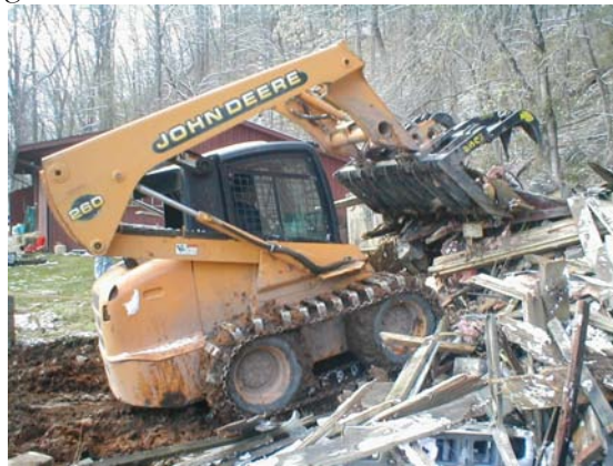
Cavers got some mechanical assistance in removing the remains of the Octagon House at Grand Caverns during the Easter Restoration Field Camp.