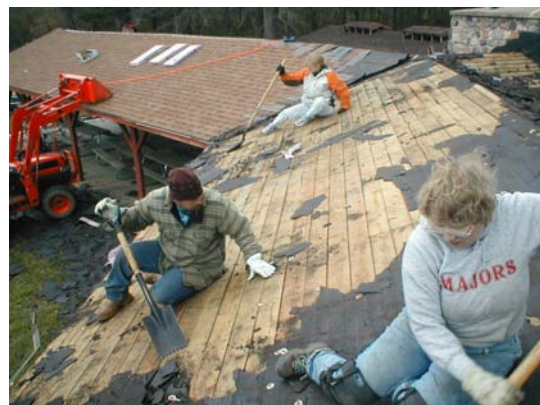
Roof work at Grand Caverns during the Easter Weekend. The roof section in the distance has been reroofed by the cavers and they are working on the foreground section. Grand Caverns Park officials were very happy with the cavers' roofing work and have requested help on more park roofs.